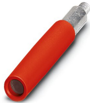
Female test connector, color: red

Please be informed that the data shown in this PDF document is generated from our Online Catalog. Please find the complete data in the user documentation. Our General Terms of Use for Downloads are valid.