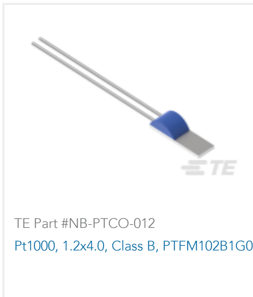
TE Part #NB-PTCO-012 Pt1000, 1.2x4.0, Class B, PTFM102B1G0