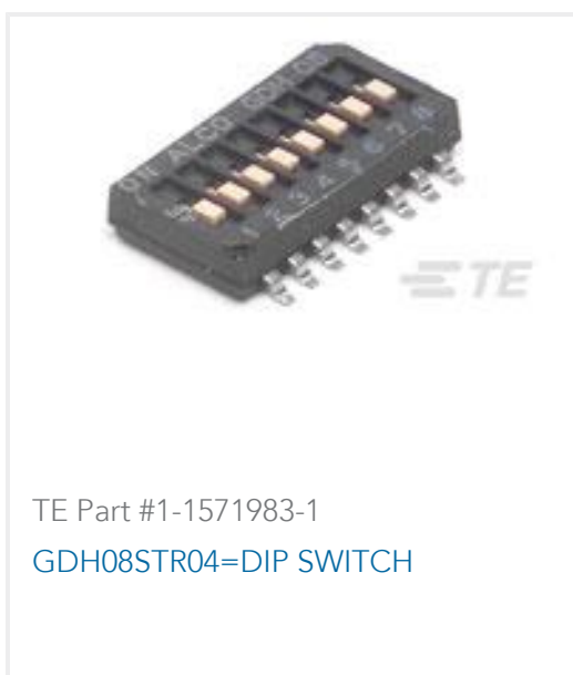
TE Part #1-1571983-1 GDH08STR04=DIP SWITCH