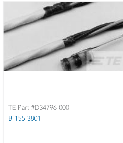
TE Part #D34796-000 B-155-3801