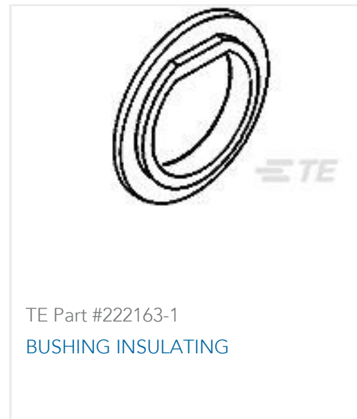
TE Part #222163-1 BUSHING INSULATING