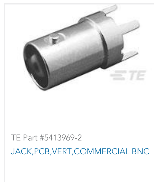
TE Part #5413969-2 JACK,PCB,VERT,COMMERCIAL BNC