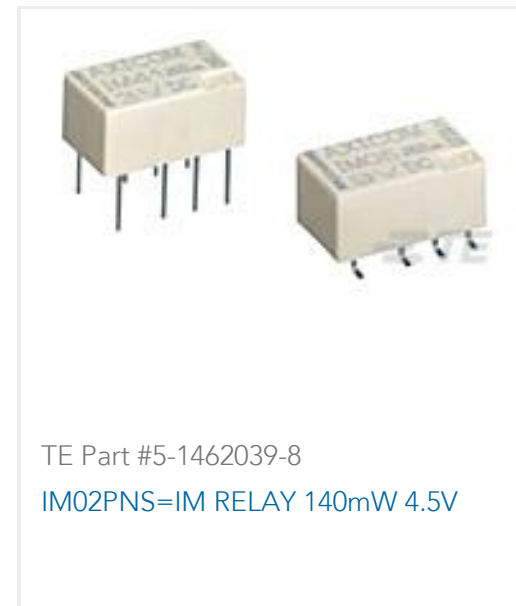
TE Part #5-1462039-8 IM02PNS=IM RELAY 140mW 4.5V