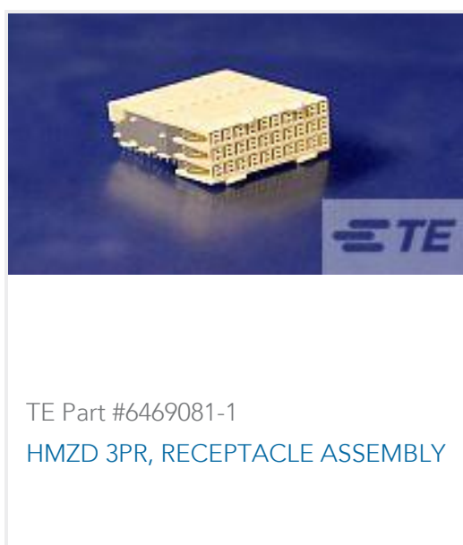
TE Part #6469081-1 HMZD 3PR, RECEPTACLE ASSEMBLY