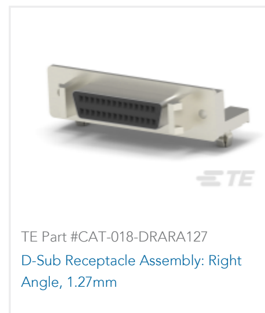
TE Part #CAT-018-DRARA127 D-Sub Receptacle Assembly: Right Angle, 1.27mm