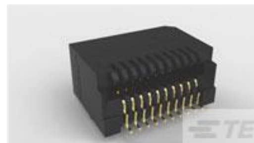
TE Part #1888247-1 20 POS SMT CONN, SFP/SFP+, 30A