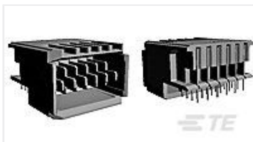
TE Part #120954-1 TE UPM R/A Header 4P HC Power, LLLL