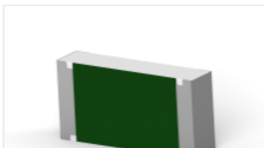
TE Part #7-2176397-7 3502 1K5 1%