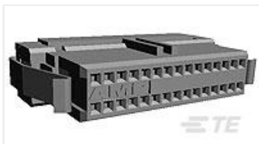
TE Part #2-111196-1 50 RCPT SYSTEM 50, LEAD FREE