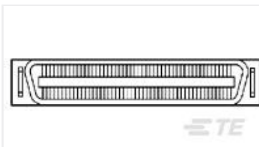
TE Part #1-1734100-3 Champ050 series,130pos,Au over PdNi