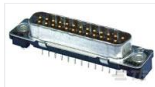
TE Part #2-5747704-0 25 PLUG SP/FMS BRDLK