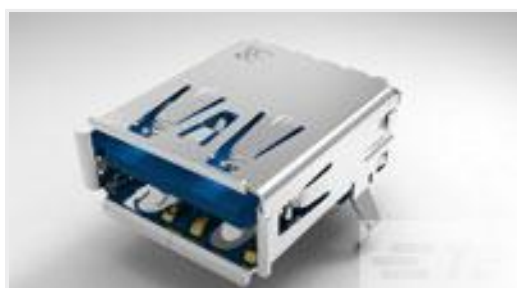
TE Part #1932258-1 Std USB 3.0, Type A, R/A, T/H,