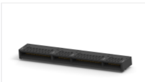
TE Part #2336568-1 RECEPT ASSY, RA, 168 POS, SLIVER 2.0