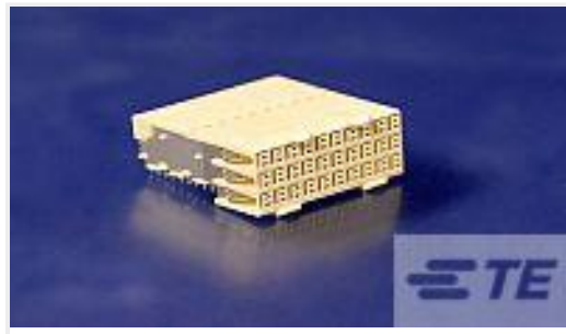
TE Part #6469081-1 HMZD 3PR, RECEPTACLE ASSEMBLY