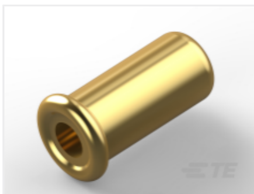
TE Part # 2-331677-6 SOCKET,MIN-SPR W/H AU SER-3