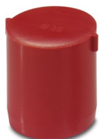
Sealing plug, color: red

Please be informed that the data shown in this PDF document is generated from our online catalog. Please find the complete data in the user documentation. Our general terms of use for downloads are valid.