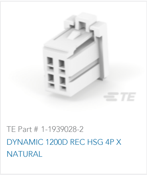
TE Part # 1-1939028-2 DYNAMIC 1200D REC HSG 4P X NATURAL