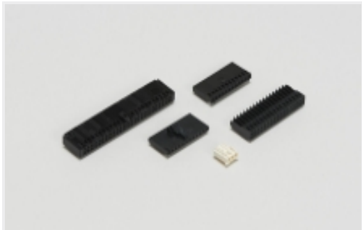
Wire-to-Board Connector Assemblies & Housings(33)