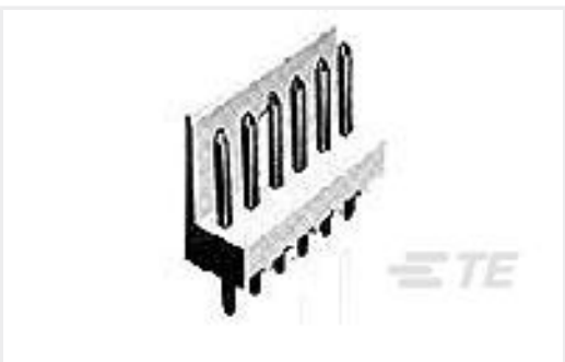
TE Part #171825-3 POST HEADER ASSY EI SRS 3POS