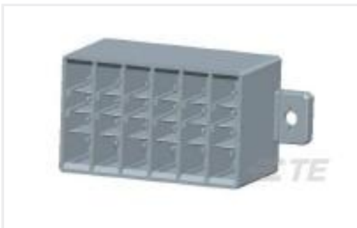
TE Part #1827691-3 DYNATAP 3200 TAP ASSY 24P BOTTOM MOUNT