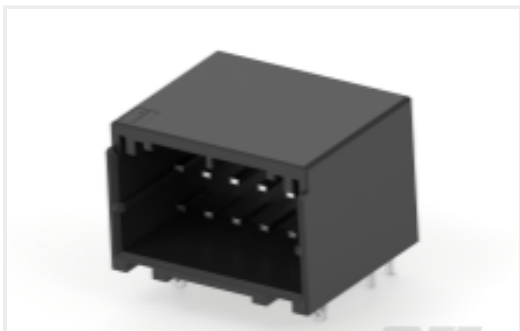
TE Part #CAT-D9934-A15F Header Assembly: Wire-to-Board, 5A, gold or tin plated