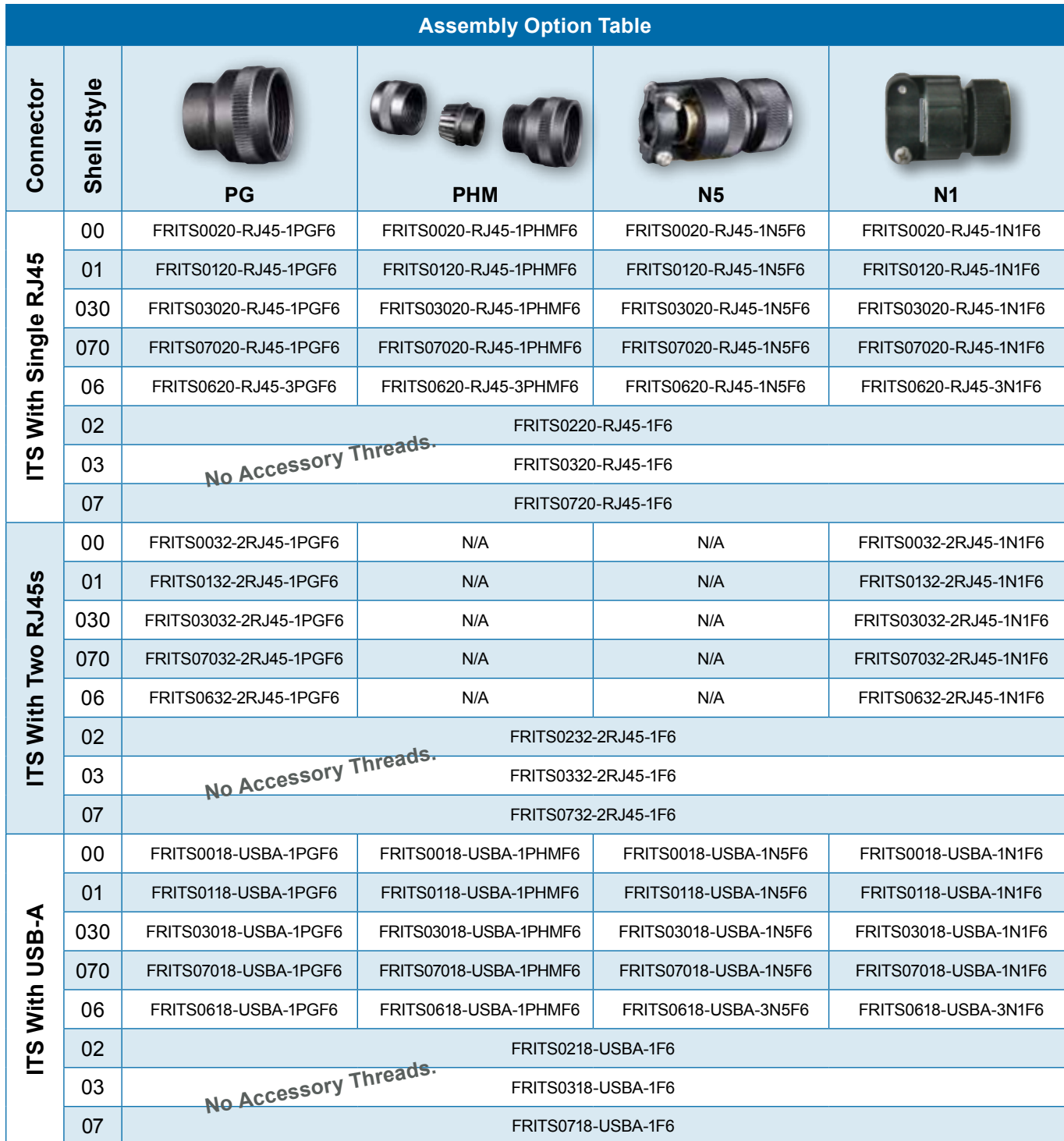
Assembly Option Table