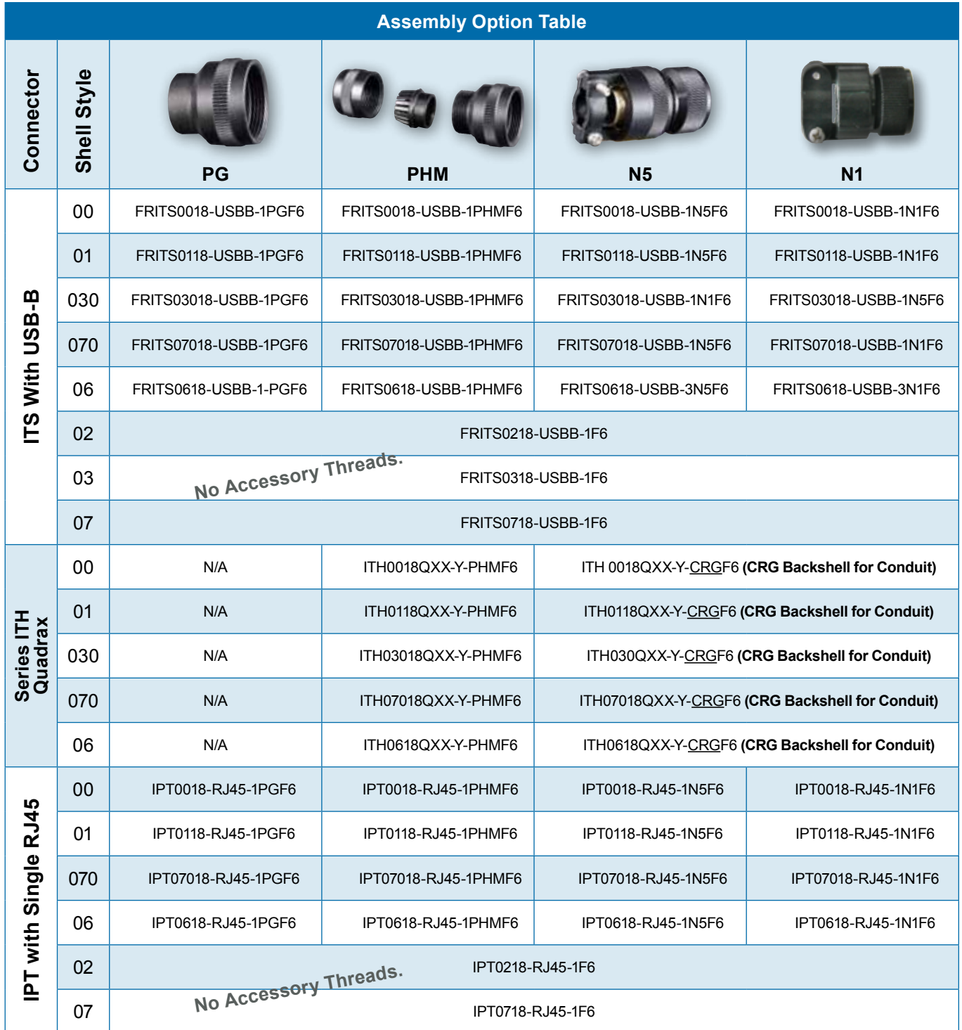
Assembly Option Table