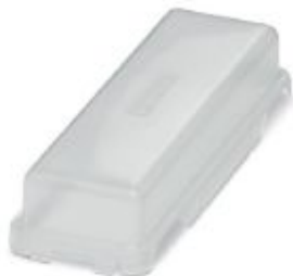
Protective covers, type: B24, degree of protection: IP20, color: transparent/white

Please be informed that the data shown in this PDF Document is generated from our Online Catalog. Please find the complete data in the user's documentation. Our General Terms of Use for Downloads are valid ( http://phoenixcontact.com/download )