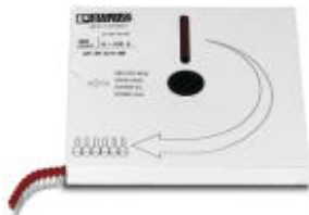
The illustration shows version AI 1,5 - 8 in red

Ferrules, 0.5 mm 2 , taped, sleeve length: 8 mm, with plastic collar, galvanically tin-plated, color: white, color range according to DIN 46228-4, CSA-certified