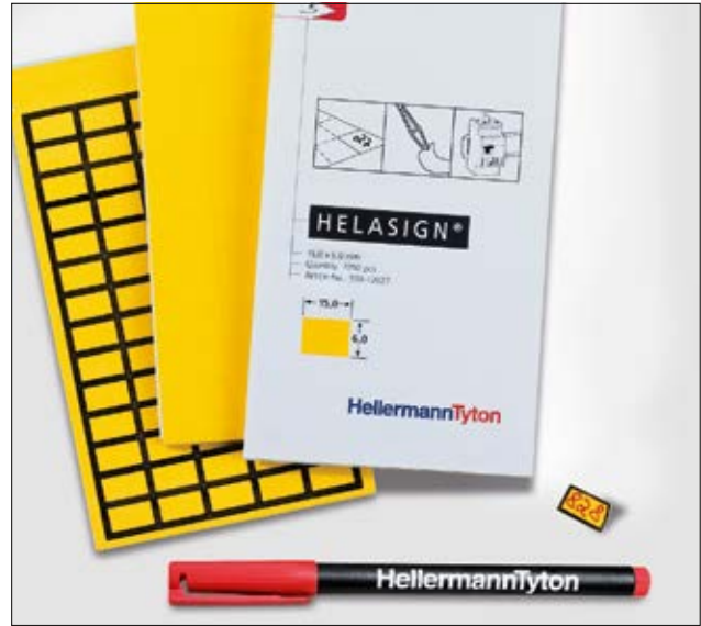
Always on hand: Labels in a convenient, pocket sized and lightweight booklet.