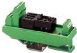
Universal module, with Hartmann & Braun plug-in base for relay 1004, contact: 4 PDT

Please be informed that the data shown in this PDF Document is generated from our Online Catalog. Please find the complete data in the user's documentation. Our General Terms of Use for Downloads are valid ( http://phoenixcontact.com/download )