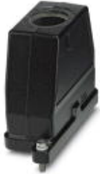
HEAVYCON B16 sleeve housing, HPR series, with screw locking, with M32 thread, straight outlet, for increased environmental and EMC requirements

Please be informed that the data shown in this PDF Document is generated from our Online Catalog. Please find the complete data in the user's documentation. Our General Terms of Use for Downloads are valid ( http://phoenixcontact.com/download )