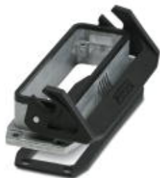
HEAVYCON B24 panel mounting base, with single locking latch, with flat gasket, salt-water-resistant aluminum, conductive profile gasket

Please be informed that the data shown in this PDF Document is generated from our Online Catalog. Please find the complete data in the user's documentation. Our General Terms of Use for Downloads are valid ( http://phoenixcontact.com/download )