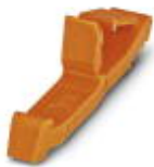
Latching, Color: orange