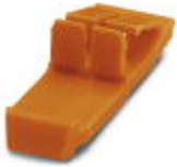
Latching, Color: orange