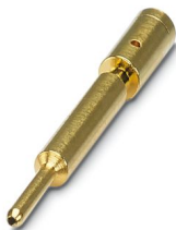
Crimp contact, Pin, turned, Single contact, contact diameter: 1 mm, crimp range: 0.5 mm 2 ... 1 mm 2

Please be informed that the data shown in this PDF document is generated from our online catalog. Please find the complete data in the user documentation. Our general terms of use for downloads are valid.