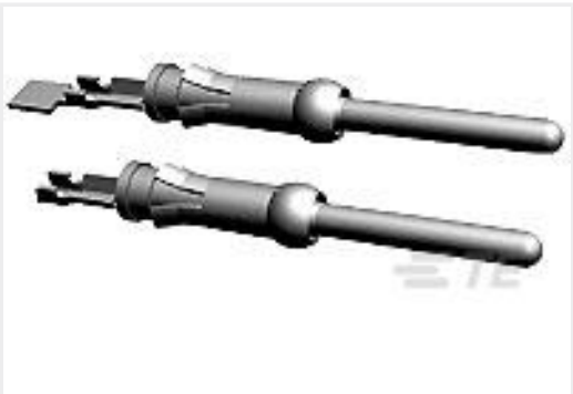
TE Part #66361-3 III+ PIN, 18-14, 15AU/FL, LP