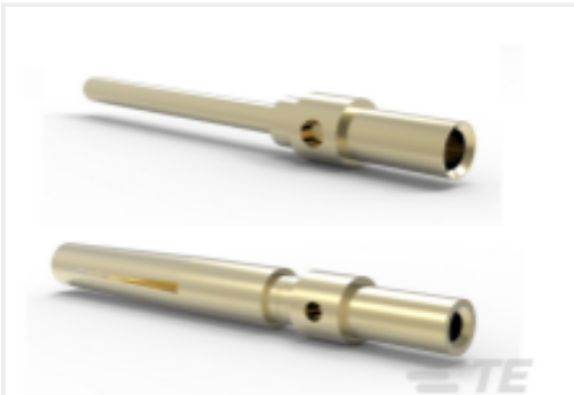
TE Part #CAT-M1-P489D M12 Crimp Contact for A8 Code