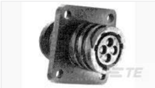
TE Part #206430-1 RECPT, SZ 11-4, CPC