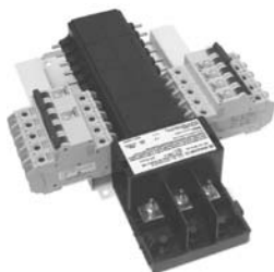
US Mounting Base for CSA C22.2 No. 5/UL489 C60 (3 conductor shown)