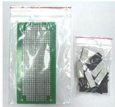
1.PCB / PCB STOPPER