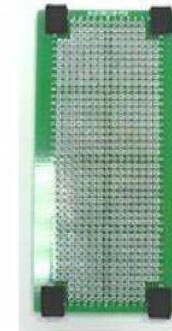
3. Repeat 2 for the other holes.