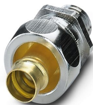
Cable gland made from brass with metric thread, IP65 protection

Please be informed that the data shown in this PDF document is generated from our online catalog. Please find the complete data in the user documentation. Our general terms of use for downloads are valid.