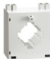
Current trasformers DM3T0300