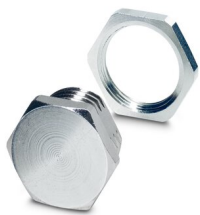
Screw plug, Rear mounting, M16 x 1.5

https://www.phoenixcontact.com/gb/products/1453368