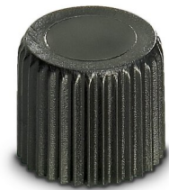
M12 sealing cap for unoccupied M12 plugs of the sensor/actuator cable, flush-type plugs and I/O devices in the field

https://www.phoenixcontact.com/gb/products/1560251