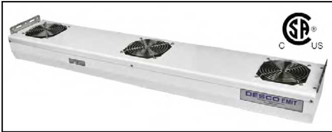
Figure 1. Desco Emit Overhead Ionizer