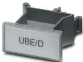
The figure shows a version of the article

Terminal strip marker carriers for marking terminal group, for mounting on the terminal strip NS 32 or NS 35/7.5, lettering field size: 40 x 17 mm