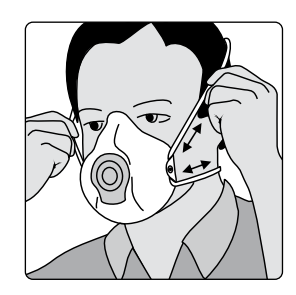
4. Adjust strap by pulling loop on strap.