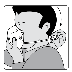
2. Place respirator on chin and pull loop over head tight to the neck.