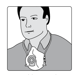
6. Let mask hang around your neck.