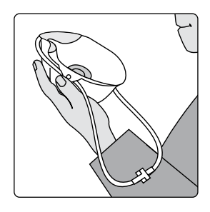
1. Pull strap to form a large loop.