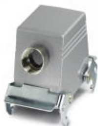
HEAVYCON sleeve housing D50, with double locking latch, height 76 mm, with support 1x M32, lateral conductor exit

Please be informed that the data shown in this PDF Document is generated from our Online Catalog. Please find the complete data in the user's documentation. Our General Terms of Use for Downloads are valid ( http://phoenixcontact.com/download )