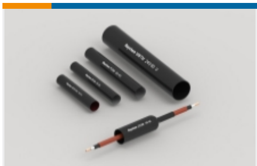
Power Cable Tubing & Accessories(26)