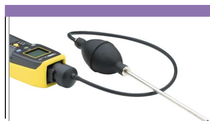
Gas extraction kit with pump and connector