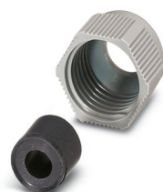
D-SUB cap nut with line seal, for sleeve housing VS-09-..., conductor diameter of 5 mm ... 9 mm

Please be informed that the data shown in this PDF document is generated from our online catalog. Please find the complete data in the user documentation. Our general terms of use for downloads are valid.