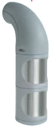
LED Traffic Light with integrated siren (2 tier)