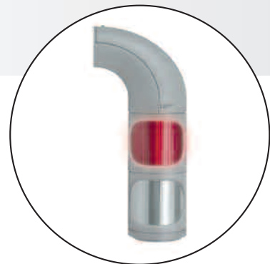
Clear lenses ensure signalling effect even in direct sunlight