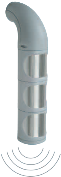
Integrated siren with high sound output up to 80 dB