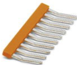
Insertion bridge, 10-pos., divisible, fully insulated

Please be informed that the data shown in this PDF Document is generated from our Online Catalog. Please find the complete data in the user's documentation. Our General Terms of Use for Downloads are valid ( http://phoenixcontact.com/download )