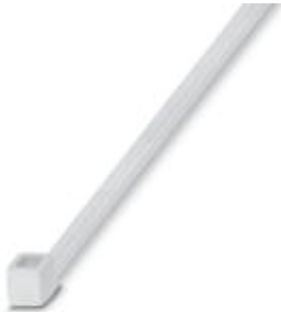
Cable binders for quick and secure bundling, standard version

Please be informed that the data shown in this PDF Document is generated from our Online Catalog. Please find the complete data in the user's documentation. Our General Terms of Use for Downloads are valid ( http://download.phoenixcontact.com )