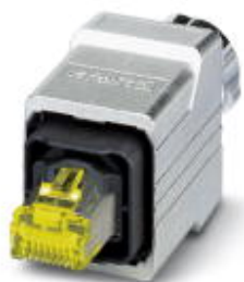
RJ45 connector, IP67, with push/pull interlocking (version 14), metal housing, for 10 Gbps, for AWG 24 ... 27 stranded conductors

Please be informed that the data shown in this PDF Document is generated from our Online Catalog. Please find the complete data in the user's documentation. Our General Terms of Use for Downloads are valid ( http://phoenixcontact.com/download )