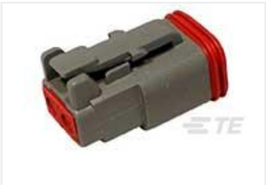
TE Part #DT06-2S PLG, 2P, GRY, N