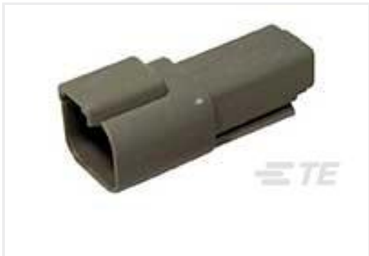
TE Part #DT04-2P REC, 2P, GRY, N