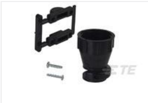
TE Part #206070-8 CABLE CLAMP KIT #17