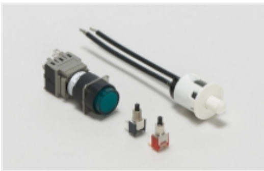
Push Button Switches(7)