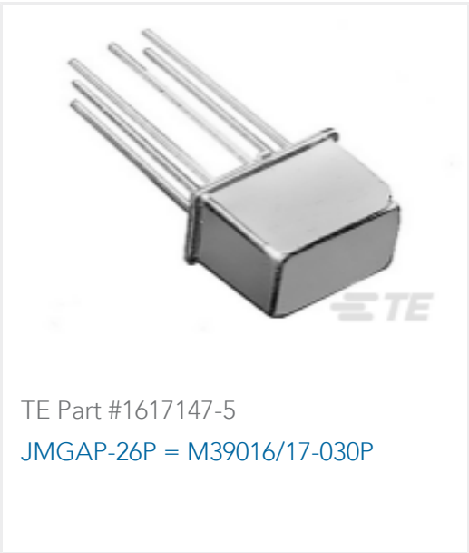
TE Part #1617147-5 JMGAP-26P = M39016/17-030P