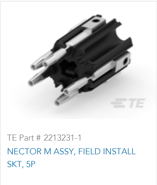
TE Part # 2213231-1 NECTOR M ASSY, FIELD INSTALL SKT, 5P