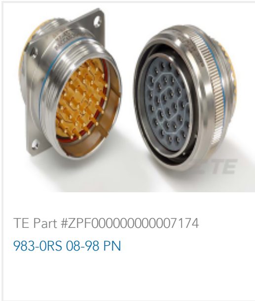
TE Part #ZPF000000000007174 983-ORS 08-98 PN