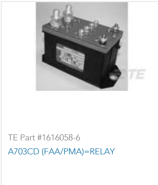
TE Part #1616058-6 A703CD (FAA/PMA)=RELAY