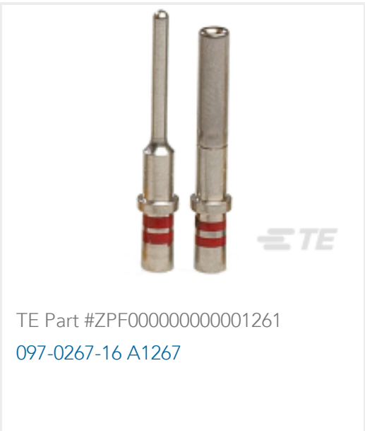
TE Part #ZPF000000000001261 097-0267-16 A1267