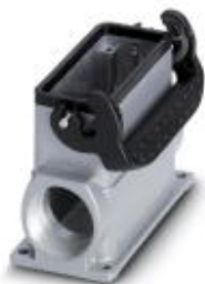
Box mounting base, with single locking latch, height 84 mm, with a support 2x PG29, with a protective cover

Please be informed that the data shown in this PDF Document is generated from our Online Catalog. Please find the complete data in the user's documentation. Our General Terms of Use for Downloads are valid ( http://phoenixcontact.com/download )