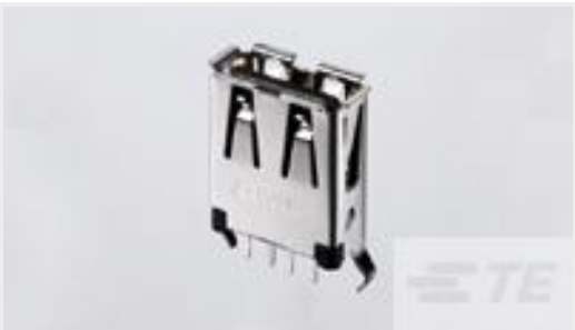
TE Part #1734366-3 Std USB Type A, VT, T/H, Blue