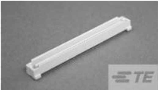
TE Part #5177984-6 0.8FH,P05H.5,140,08/Sn,TU