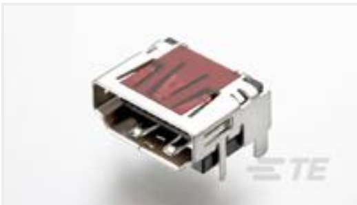
TE Part #1747981-2 Std HDMI, RA, SMT