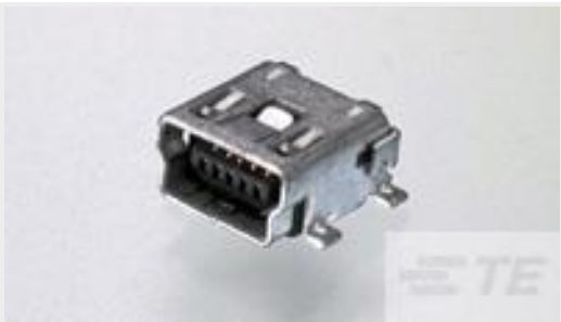
TE Part #1-1734035-2 MINI USB, TYPE B, R/A, SMT