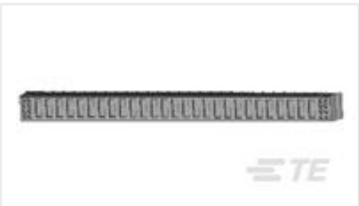
TE Part #1-6450869-0 V/R 2ACP+8S+4ACP+16S+2ACP+12S+2ACP