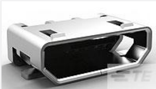
TE Part #2174507-2 MICRO USB, TYPE B