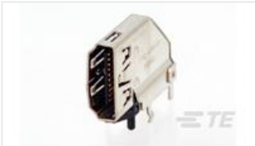
TE Part #2007435-3 Std HDMI, Flag, T/H