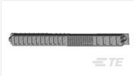
TE Part #6450863-5 MBXLE VERT RCPT 7ACP