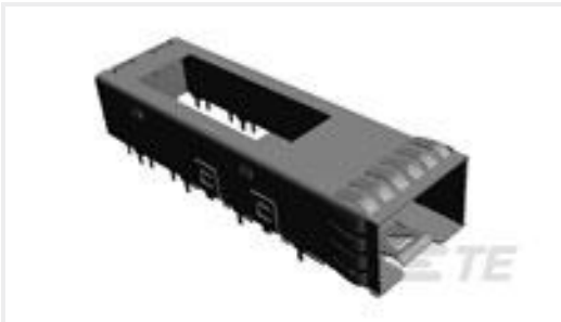
TE Part #2110304-1 SFP+ 1x1 Cage Assembly, Solder Tail