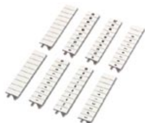
Zack marker strip, 10-section, horizontally labeled with the consecutive numbers: 261 ... 270, white, Width: 5 mm

Please be informed that the data shown in this PDF Document is generated from our Online Catalog. Please find the complete data in the user's documentation. Our General Terms of Use for Downloads are valid ( http://download.phoenixcontact.com )