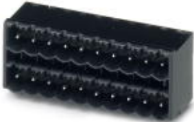
The figure shows a 10-pos. version with 20 contacts

Header, Nominal current: 12 A, Rated voltage (III/2): 400 V, Number of positions: 5, Pitch: 5.08 mm, Color: black, Contact surface: Tin, Mounting: Taped SMD/THT/THR components