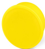
Plastic protective cap, M23, series: CA, RC, RF, UC, RM

https://www.phoenixcontact.com/in/products/1577206