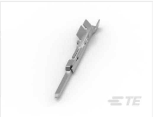
TE Part #1-1438299-0 GET MALE TERM, A, AG REREEL