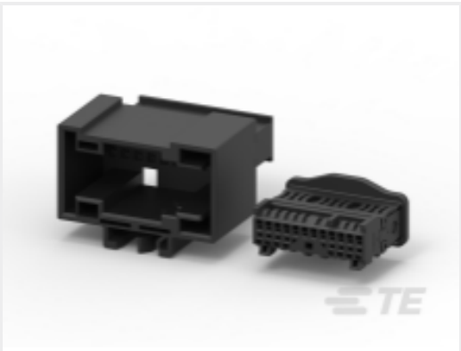
TE Part #CAT-M8793-CH8172 MQS, CONNECTOR HOUSING