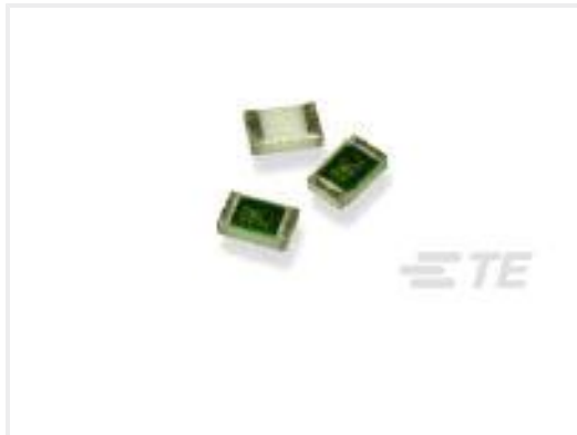
TE Part #3-1879338-6 CPF 0603 61K9 1% 50PPM 1K RL