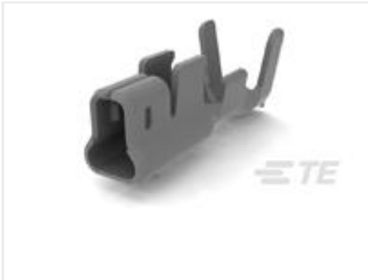
TE Part #1744423-1 EP 2.5 RCPT CONTACT, 24-20 AWG