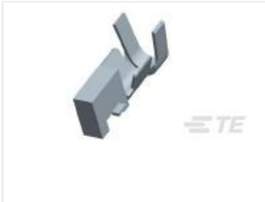
TE Part #1971031-1 Receptacle contact for GIC 2.0