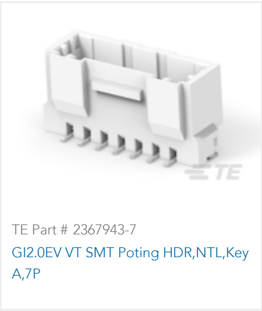
TE Part # 2367943-7 GIC2.0EV VT SMT Poting HDR,NTL,Key A,7P