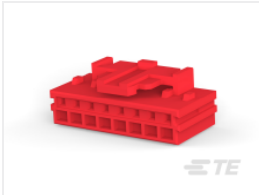
TE Part #1-1971030-8 8POS Plug Housing for GIC 2.0 EV Series