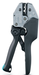
Crimping pliers, for uninsulated cable lugs, 0.34 mm 2 ... 6 mm 2 , indent crimp

Please be informed that the data shown in this PDF Document is generated from our Online Catalog. Please find the complete data in the user's documentation. Our General Terms of Use for Downloads are valid ( http://phoenixcontact.com/download )