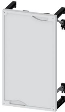
ALPHA 400/630 DIN, Assembly kit Modular terminal blocks with terminal strip Section cover closed vertical, H=450 W=250