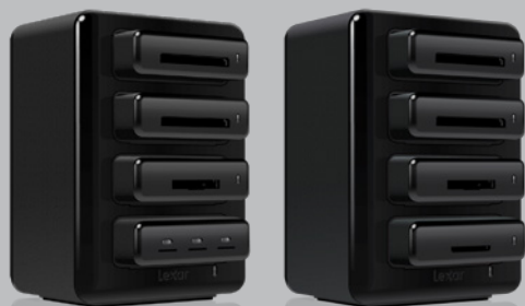
Professional Workflow HR1 (USB 3.0 Hub)