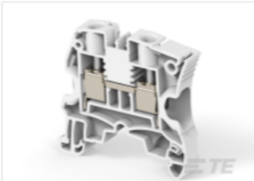
TE Part #1SNK508065R0000 ZS10-WH