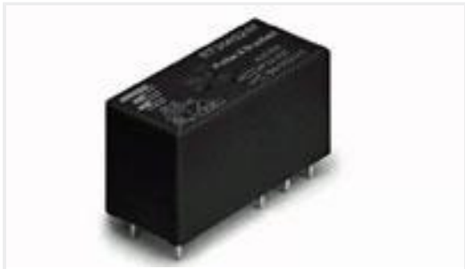
TE Part #3-1393237-4 RTE24048F