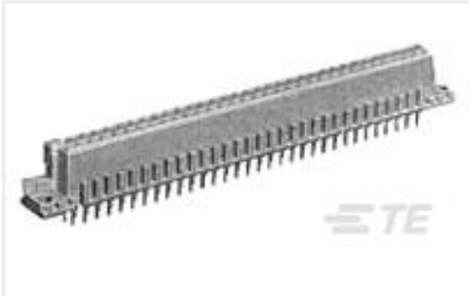
TE Part #5650861-5 ASSEMBLY,RECEPTACLE,EUROCARD, T