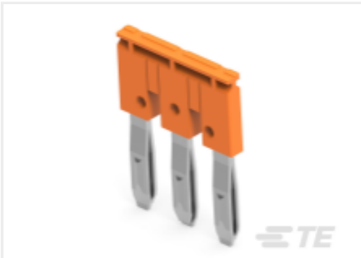
TE Part #1SNK908303R0000 JB8-3