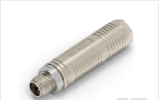
TE Part #2327989-1 M12 X-CODE CAT6A