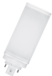
146345 DULUX T/E LED GX24q-2 HF & AC 7W (18W) 830