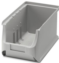
Storage box for small parts in size L.

Please be informed that the data shown in this PDF document is generated from our online catalog. Please find the complete data in the user documentation. Our general terms of use for downloads are valid.