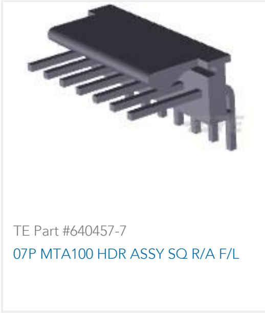
TE Part #640457-7 07P MTA100 HDR ASSY SQ R/A F/L