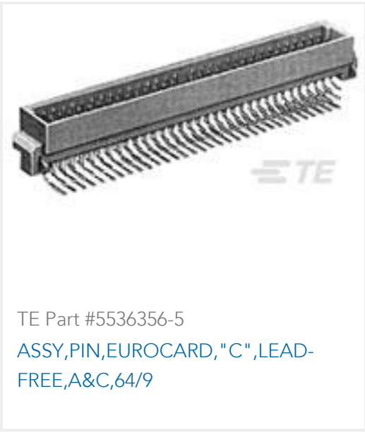
TE Part #5536356-5 ASSY,PIN,EUROCARD,"C",LEAD-FREE,A&C,64/9