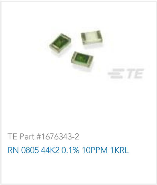
TE Part #1676343-2 RN 0805 44K2 0.1% 10PPM 1KRL