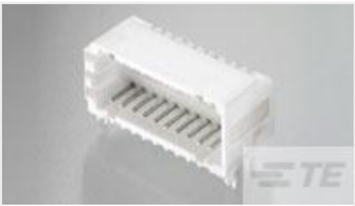
TE Part #2-292138-4 CT DOUBLE ROW ASSY H 24P HDR N