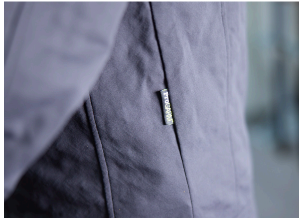
Lightweight PYRAD® Technology by GORE-TEX Labs