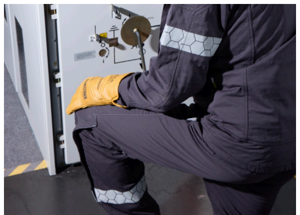
Increased ease of motion with less muscular fatigue