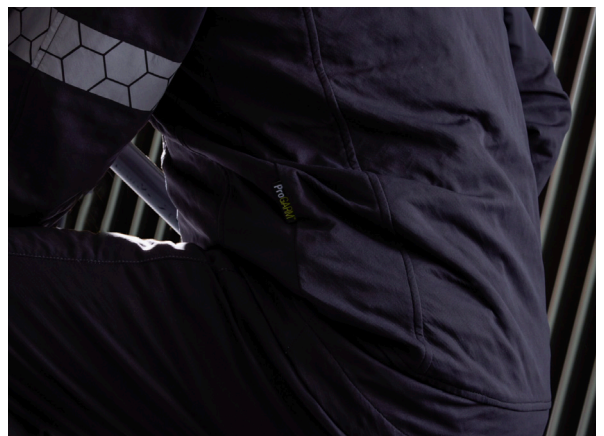
More comfortable during high-intensity activities