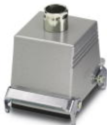
Coupling housing, with double locking latch, height 82 mm, with screw connection, 1x Pg29

Please be informed that the data shown in this PDF Document is generated from our Online Catalog. Please find the complete data in the user's documentation. Our General Terms of Use for Downloads are valid ( http://phoenixcontact.com/download )