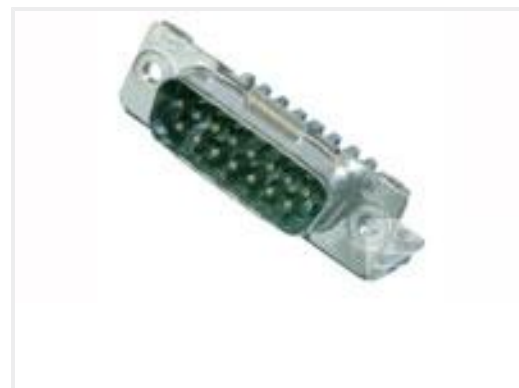
TE Part #1-338169-2 15P HDP20 PLUG ASSY