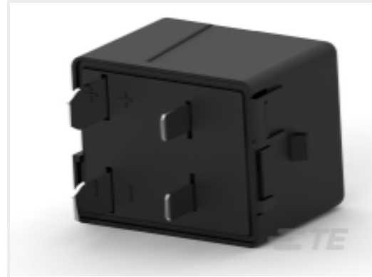
TE Part # 2203997-1 RELAY,EVC80 ASMBY,SEALED