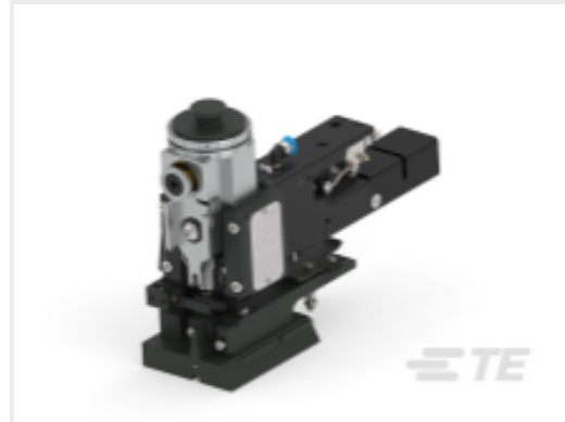
TE Part # 2150334-1 OCEAN_2.0_Applicator-E-090F130F-REM