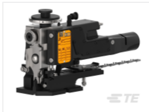
TE Part # 2150334-2 OCEAN_2.0_Applicator-E-090F130F-REA