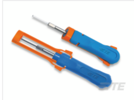
TE Part # 1-1579007-4 EXTRACTION TOOL