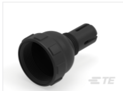
TE Part #M902-2161 BKSHL, 6SZ, CBL SZ .187-.300, HD10