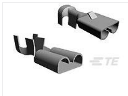
TE Part #160927-4 FF 250 REC 1.0-2.5MM2 TPPB