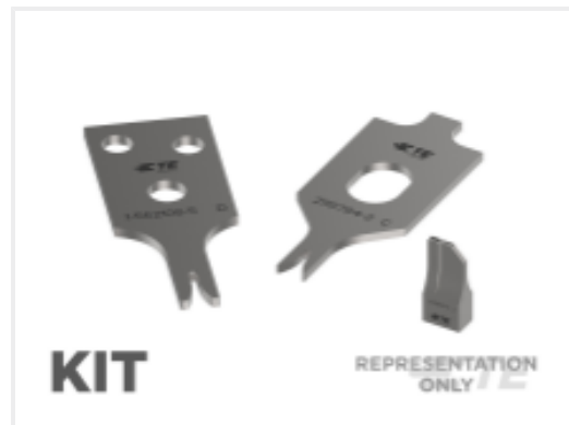
TE Part # 7-2150334-7 OCEAN_2.0_SPARE_PART_KIT-090F130F