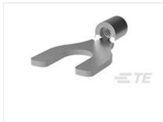
TE Part #321463 SOLIS SPD 22-16COMM 22-18MIL 4