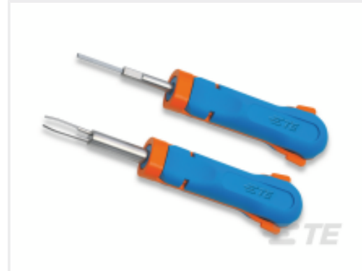
TE Part # 4-1579007-3 EXTRACTION TOOL KIT