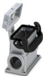
Box mounting base, with single locking latch, height 67 mm, with a support 2x Pg21, with a protective cover

Please be informed that the data shown in this PDF Document is generated from our Online Catalog. Please find the complete data in the user's documentation. Our General Terms of Use for Downloads are valid ( http://phoenixcontact.com/download )